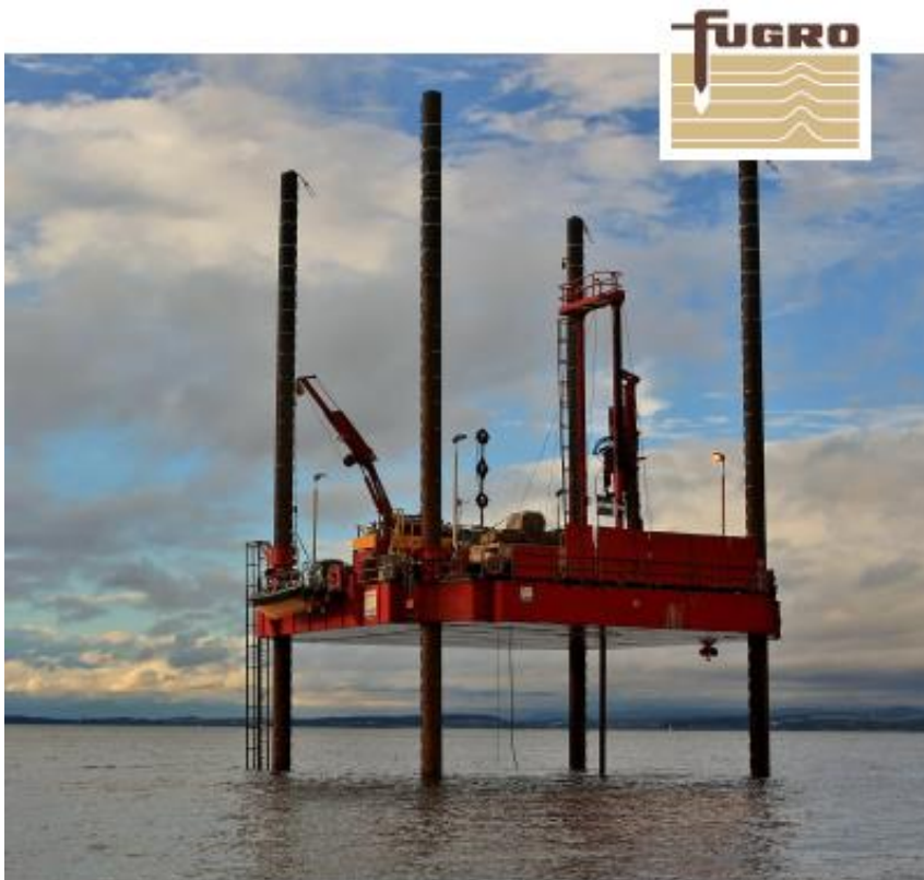
Aran 120A –jack-up Drilling platform