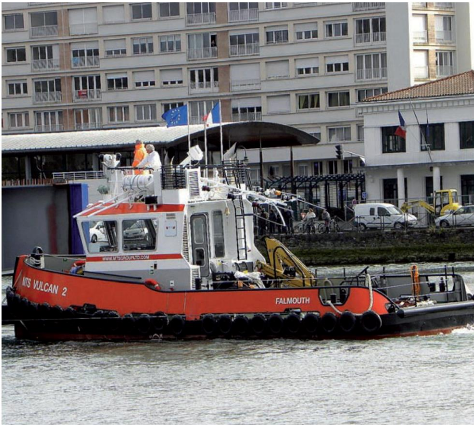
Support tug – MTS Vulcan 2