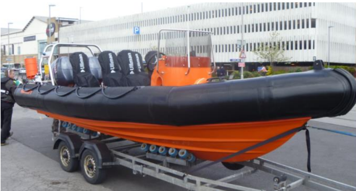
Crew Transfer RIB – Oyster